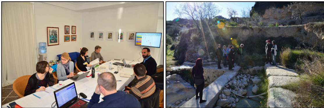
Figures 2 and 3: Project meeting and field visit during a visit to the Spanish case study in Benidorm. The project partners visited medieval water infrastructure and appreciated that there is a long story in the area about innovations dealing with water scarcity.

Helmholtz-Zentrum Geesthacht Zentrum für Material- und Küstenforschung GmbH, particularly its Climate Service Center Germany (GERICS), is the lead partner and focuses on the interactions of cities with droughts under climate change in a case study in a Mediterranean tourism hub in Spain. Universität für Bodenkultur Wien, Austria, runs an agricultural model that reproduces land, water and energy use in agriculture and applies it to a case study in Austria. Centre for Ecological Research and Forestry Applications, Spain, does the hydrological simulations for the Spanish case study. And finally, the National Institute for Research and Development in Forestry "Marin Dracea", Romania, prepared a case study linking forestry land use with urban resilience to droughts. The stakeholders in the project are mostly in the urban planning, water management, and agriculture and forestry sectors, depending on each case study.